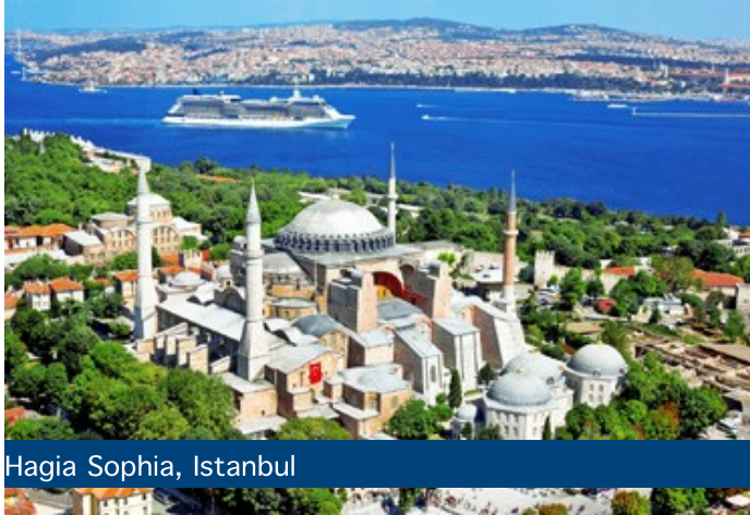
Hagia Sophia, Istanbul