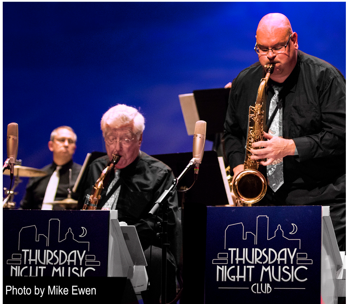
Thursday Night Music Club

For additional information, email actu@thomasu.edu or call 229-227-6964.